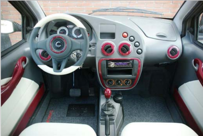
INSIDE DIVA WITH INSERTS COLOUR IN MAGENTA